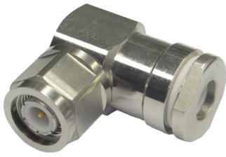
TNC Male Right Angle for CNT-300 braided cable