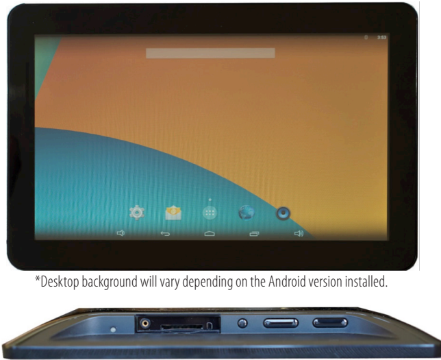
*Desktop background will vary depending on the Android version installed.

Model: MCT-70QDS / MCT-70QDS-POE / MCT-10QDS / MCT-10QDS-POE / MCT-10HPQ / MCT-10HPQ-POE / MCT-156QDS / MCT-156QDS-POE / MCT-156HPQ / MCT-156HPQ-POE