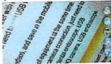
( HTwifi )

and then you can take pictures and video.