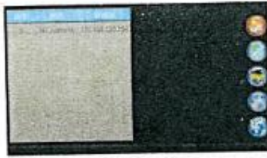
( HTwifi )