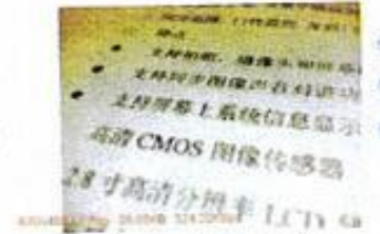
( guantianxia )

Note: MJPG camera frame rate will higher than the YUV rate. So suggest you can choose to use the MJPG camera, YUV format effects has delay phenomenon.